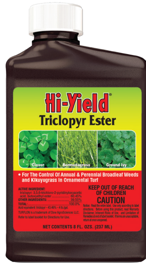
35261 *CA Triclopyr Ester Concentrate

UPC Number 7-32221- 35261-2 12/8 oz.-120 cases per pallet