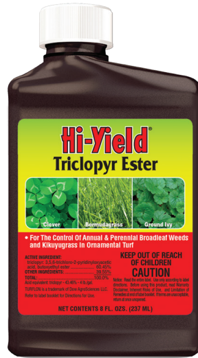
35261 Triclopyr Ester Concentrate